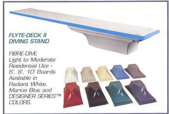
FLYTE-DECK II DIVING STAND

As an added cost option, the Flyte-Deck II Stand and Fibre-Dive Board is available in Marine Blue as well as in the current DESIGNER SERIES™ COLORS of Sapphire Blue, Emerald Green, Black Onyx, Strawberry Coral, Aged Ivory, Pewter Gray and Silver Gray. (See below)