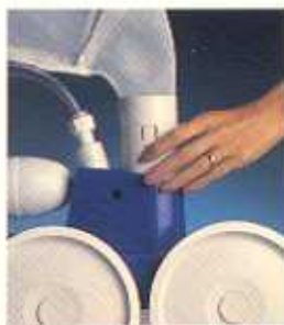
Improved easy-to-remove bag empties in seconds into your trash, not your pool filter.

In designing our top-of-the-line 380, our engineers made significant design improvements that make it as perfect as possible.