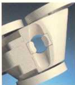
The large opening on the bottom vacuums up heavier debris like large leaves and acorns without clogging.

I t's about time for the Polaris Vac-Sweep® 380. Designed with the most advanced technology, the Polaris 380 is the fastest, most powerful and most durable automatic pool cleaning system in the world. It frees you from the time-consuming routine of vacuuming the pool bottom, sweeping walls and hard-to-clean places, and cleaning the filter and pump basket. Plus, it enhances the effectiveness of your chemicals. Polaris 380 does all the hard work for you, leaving you with a sparkling clean pool—and plenty of free time to enjoy it!