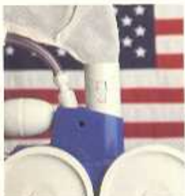
Polaris Vac-Sweep 380 is designed, patented and built in the United States.

and tested. You'll find them at almost all pool retailers, builders or service companies in the United States. Just make sure