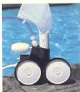
Polaris has thought of everything! Choose the Black Max model to complement dark-bottomed pools.

Look what else Polaris has for your pool and spa. Polaris Black Max —The Polaris 380 is also available in a black model for dark-bottom pools. Polaris WaterStars Fountains —Once your pool is automatically set up for one of our beautiful WaterStars fountains. Choose a gentle rainfall sound or a