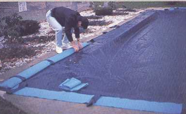
Spread the cover over the pool, insert water tubes in straps...