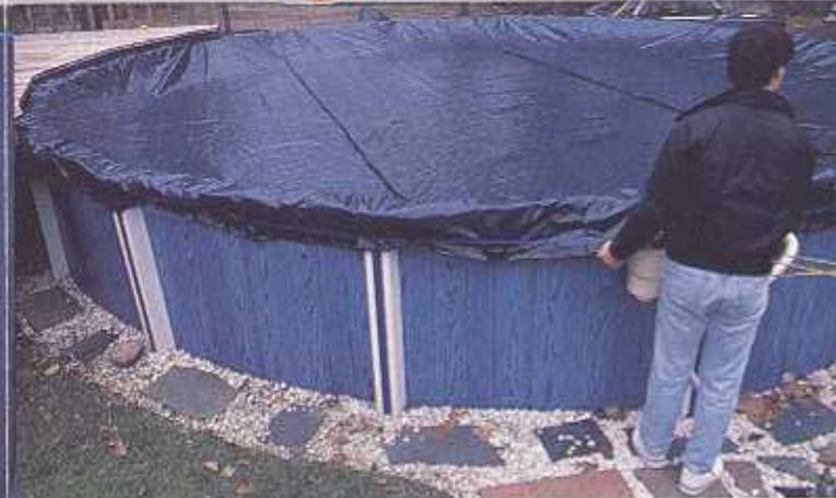
Spread above-ground cover over pool, thread cable through grommets around pool until snug...