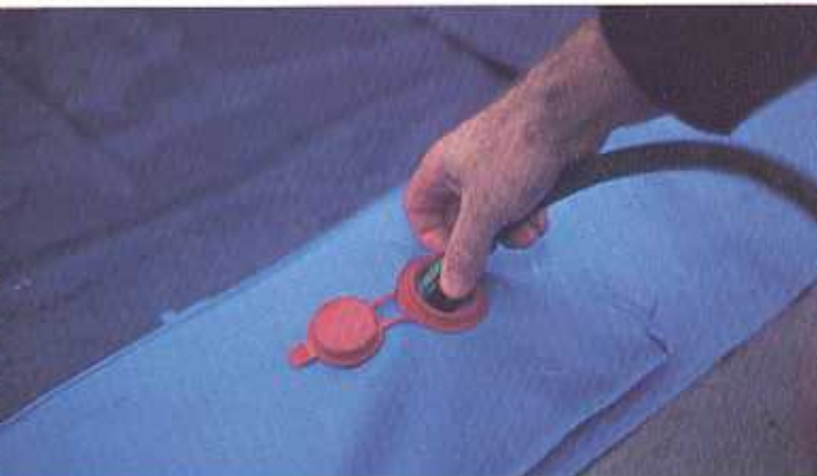
Fill tubes half full with garden hose...