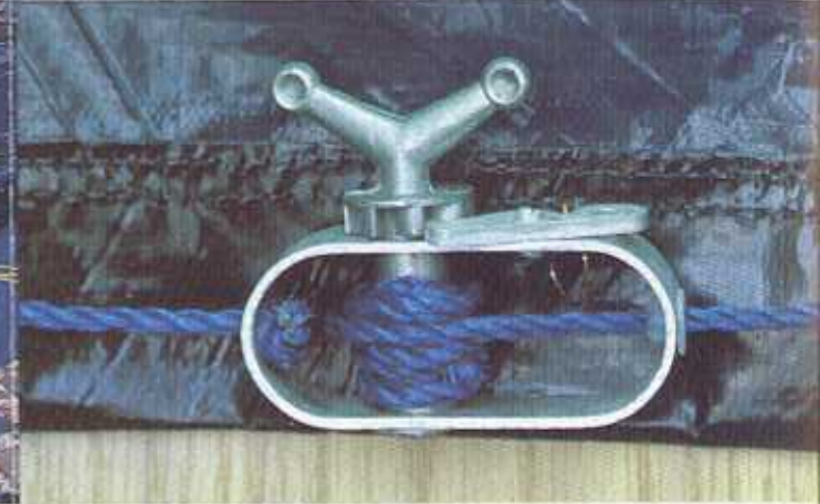
Tighten with Quick-ty winch...